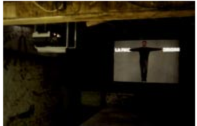
Projection work by Gianluca Ferrari in the gallery basement

From a curatorial point of view, the exhibition highlighted the way this kind of event can be more effectively promoted, through extension into the channels of communication afforded by present day internet structures. Also a printable catalogue of the exhibition, made by Gianluca Ferrari, is available on the website, which will be used to promote further exhibitions of this growing network of artists.