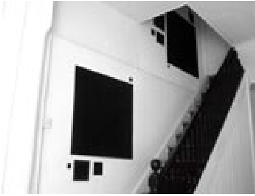
Stair installation by Damiano Paroni

The gallery has a window frontage on a busy street, so that passers-by can look in even when the gallery was not open. Information about the exhibition and the web address was also displayed in the window.